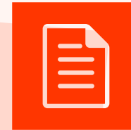
Google Drive Files