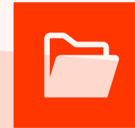
Google Drive Folders